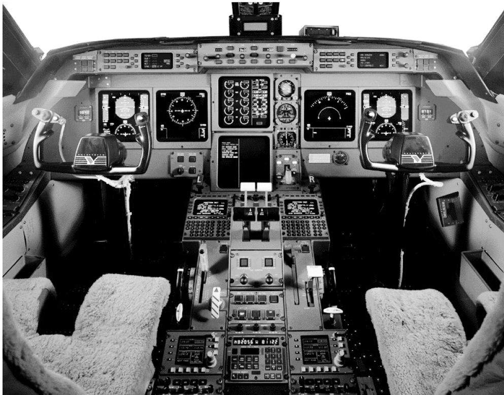
FIGURE 9.5 Gulfstream GV flight deck.

Of note is the way that this flight deck design evolution affects the manner in which pilots access and manage information. Figure 9.2 illustrates the flight deck with dedicated gages and dials, with one display per piece of information. In contrast, the flight deck shown in Figure 9.4 has even more information available, and the pilot must access it in entirely different manner. Some of the information is integrated in a form that the pilot can more readily interpret (e.g., moving map displays). Other information must be accessed through pages of menus. The point is that there has been a fundamental change in information management in the flight deck, not through intentional design but through introduction of technology, often for other purposes.