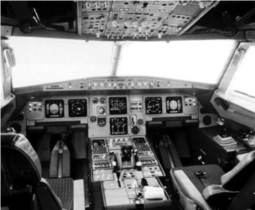
FIGURE 9.4 Representative second-generation “glass cockpit” (Airbus A320) flight deck.

display and FMS were more complex autopilots (added modes from the FMS and other requirements). This generation of aircraft also featured the introduction of an integrated Caution and Warning System, usually displayed in a center CRT with engine information. A major feature of this Caution and Warning System was that it prioritized alerts according to a strict hierarchy of “warnings” (immediate crew action required), “cautions” (immediate crew awareness and future action required), and “advisories” (crew awareness and possible action required). 17