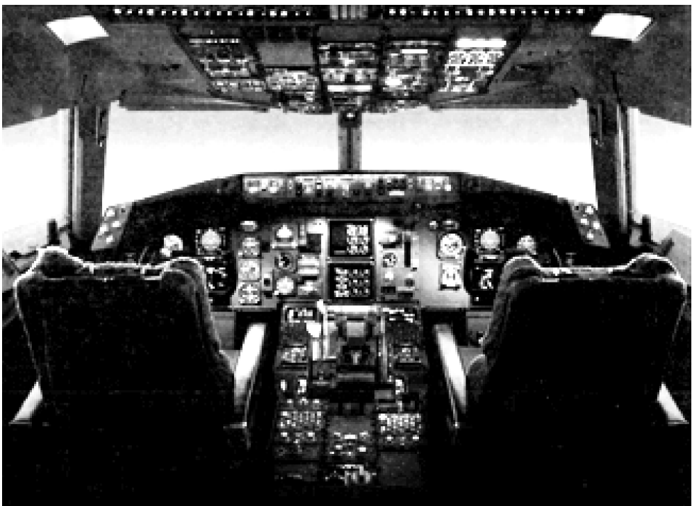
FIGURE 9.3 Representative first-generation “glass cockpit” (B-757) flight deck.