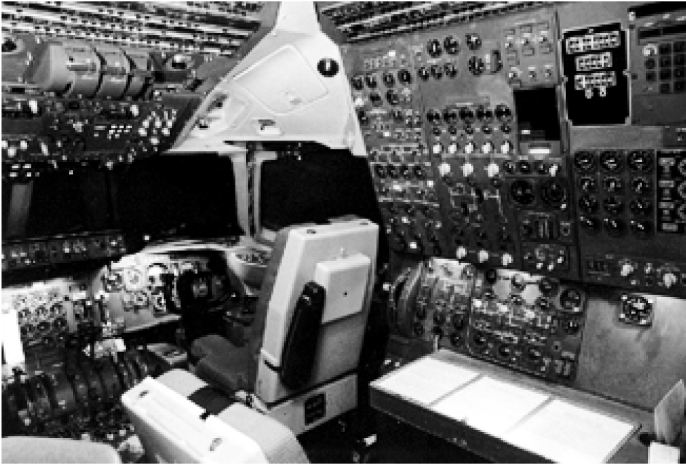
FIGURE 9.2 Representative “classic” flight deck (DC-10).